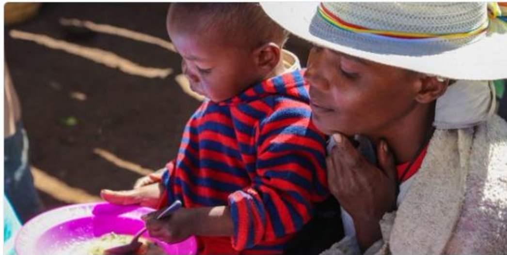
Using AI to help save lives - Microsoft on the Issues

We have a responsibility to develop technologies that promote respect for human rights. This is why I am so excited to announce Microsoft's AI for Humanitarian Action program. #AlforGood